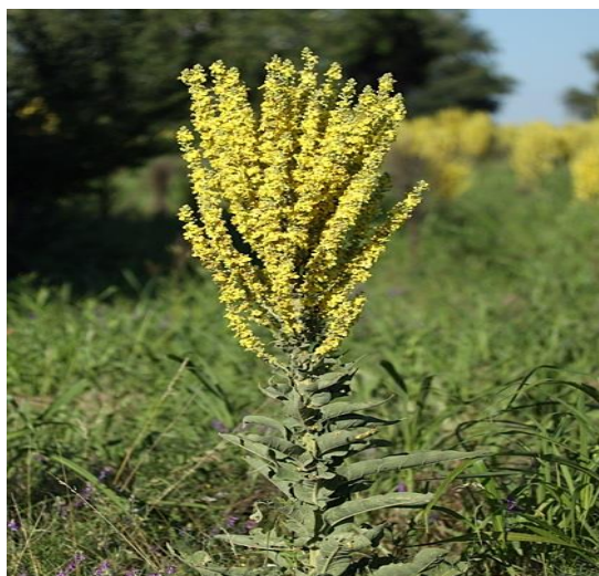
Figure 1. verbascum speciosum

verbasitie, verbascenine, verbamedine, verdoline and verbasine verballoscenine, verbaskin[11], [13]. verbametrine, isovebametrine [12],