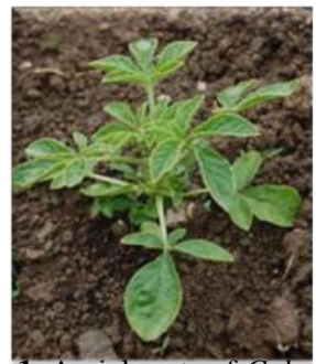
Figure 1. Aerial parts of C. heratensis

Aerial parts of C. heratensis (Figure 1) were harvested at four developmental stages of growth (vegetative (S_1) , flowering (S_2) , fruiting stages (S_3) and seeding stages (S<sub>4</sub>), respectively) in the wild habitat in plains around Birjand, South Khorasan Province in August, early September, late September and October 2014, respectively. Specimen of the sample was identified in the herbarium of agriculture institute. Mashhad. Iran.