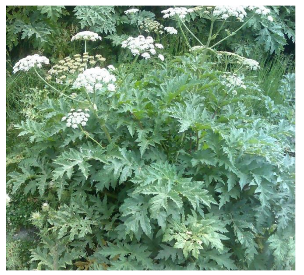
Figure 1. H. rawianum

remarkable amount of angelicin was isolated from Heracleum rawianum in 8% yield.