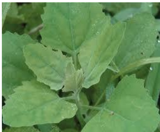
Figure 1. Picture of Chenopodium album

In this research, we have utilized the leaf extract of Chenopodium album for synthesizing \text{CoFe}_2\text{O}_4 nanoparticles. Chenopodium album is a fast-growing weedy annual plant (Figure 1). It is one of the most widely distributed plants in the world [28], tolerant of poor soils, high altitudes, and minimal rainfall. Global warming is just fine with Chenopodium album . In higher concentrations of carbon dioxide, it grows almost double in size. A wide variety of chemical constituent's such as aldehyde, alkaloids, proteins, flavonoids, were reported in phytochemical studies from this plant [29,30].