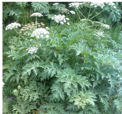
Figure 1. H. rawianum

furocoumarins, 1–3 (Figure 2). A remarkable amount of angelicin was isolated from Heracleum rawianum in 8% yield.